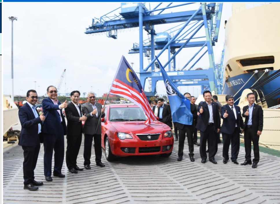
Flag-off ceremony at Westports with Proton's first exports since Geely becomes a partner